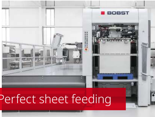
Perfect sheet feeding